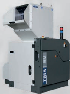
BM Series BM 3530 BM 5030