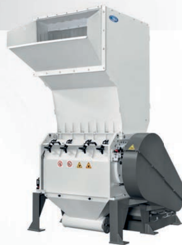
BM Series BM 7060 BM 11060