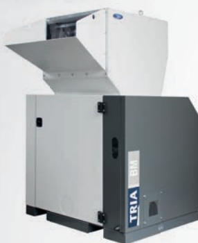
BM Series BM 6042 BM 9042 BM 12042